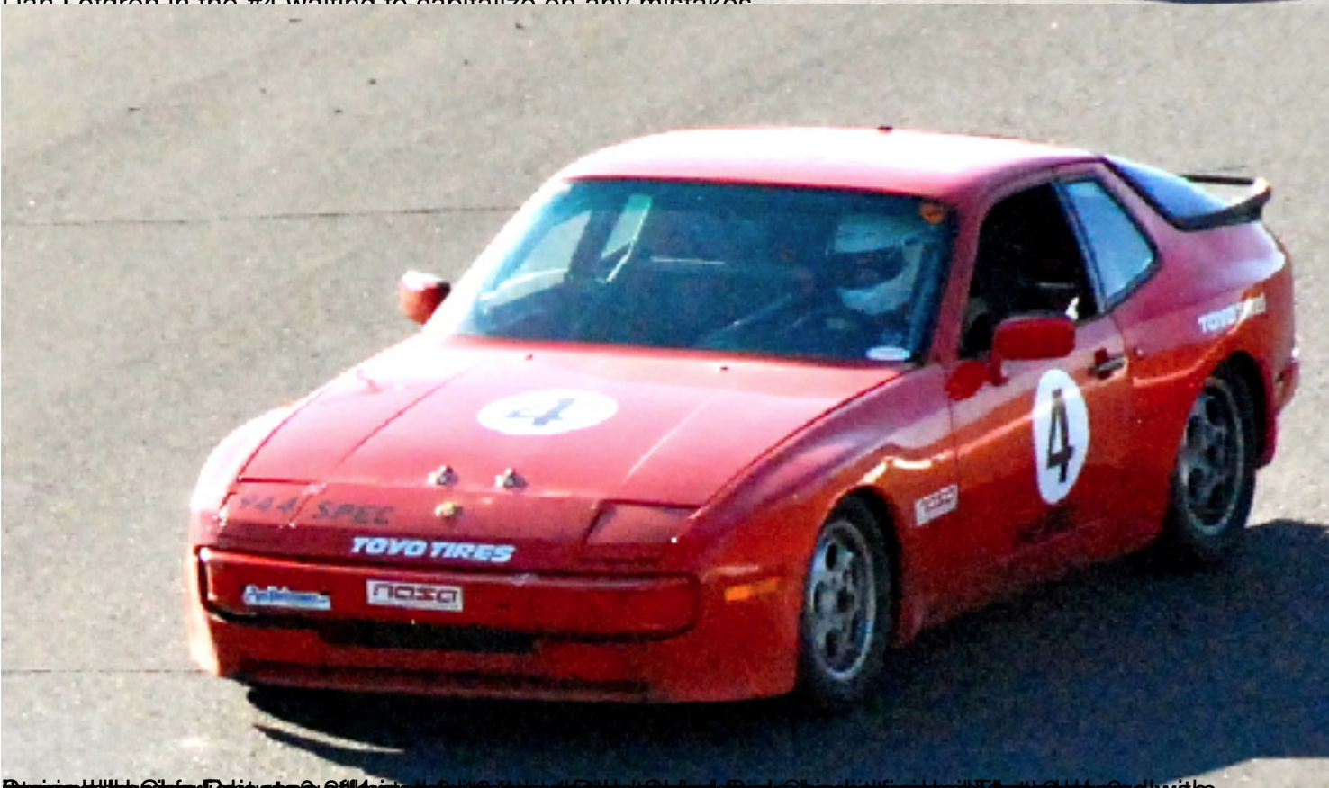
George Hill in the #4 waiting to capitalize on any mistakes